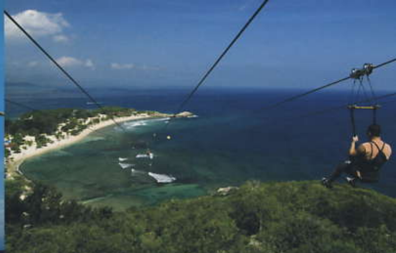
Dragon's Breath Flight Line