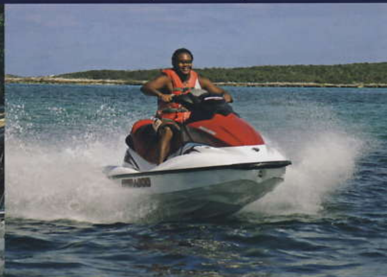
SeaTrek Wave Jet Tour