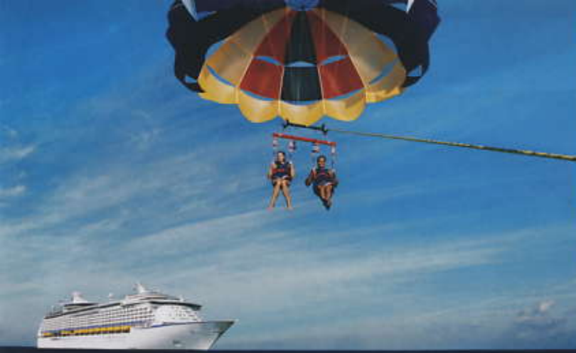
SeaTrek Parasail Adventure