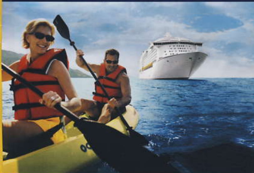
SeaTrek Kayak Adventure