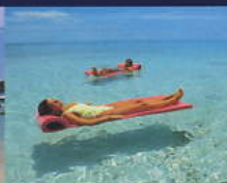
Floating Beach Mat