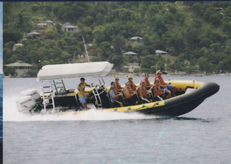
High Speed Coastal Cruise & Swim