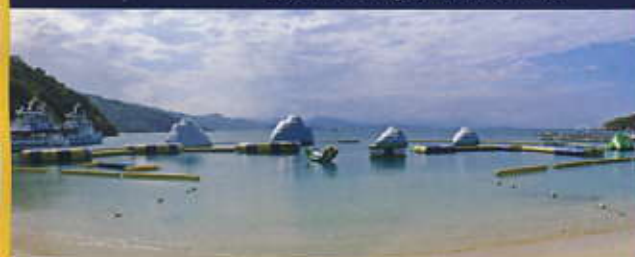
Arawak Aqua Park