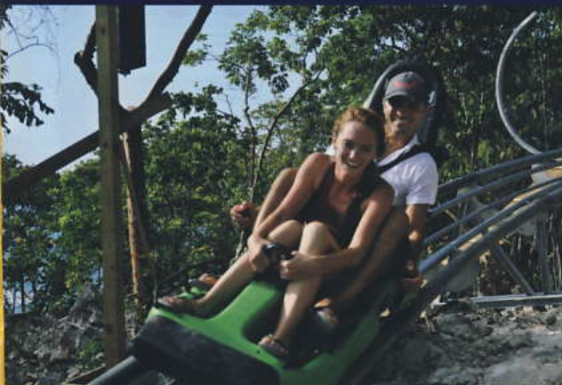
Dragon's Tail Coaster