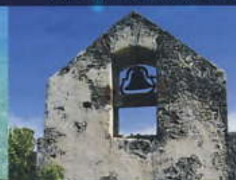
Labadee Historic Walking Tour